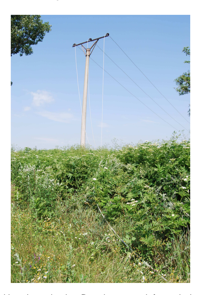
The Aviation and Maritime Investigation Board was not informed about any circumstances with potential claims for compensation of other damages toward a third party.

High tension cables were torn during the accident.