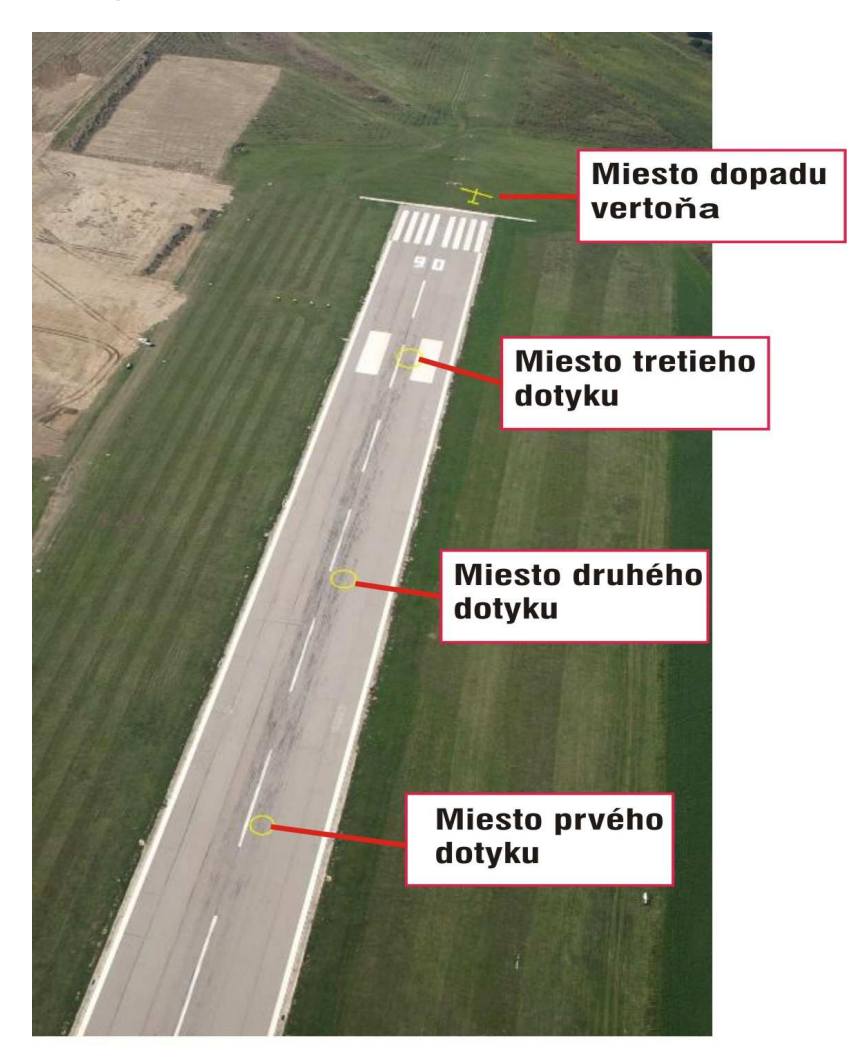
Celková situácia VPD 24 LZZI