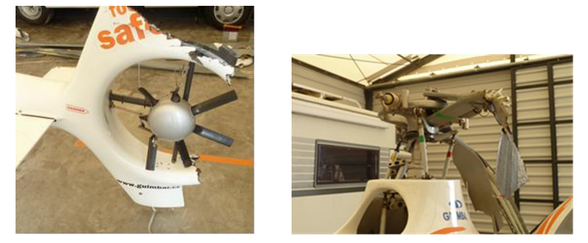
Pictures 1, 2. When the helicopter fell down, the fenestron and consequently the MR and the engine were stopped by force

The helicopter sustained major damage when it hit the ground.