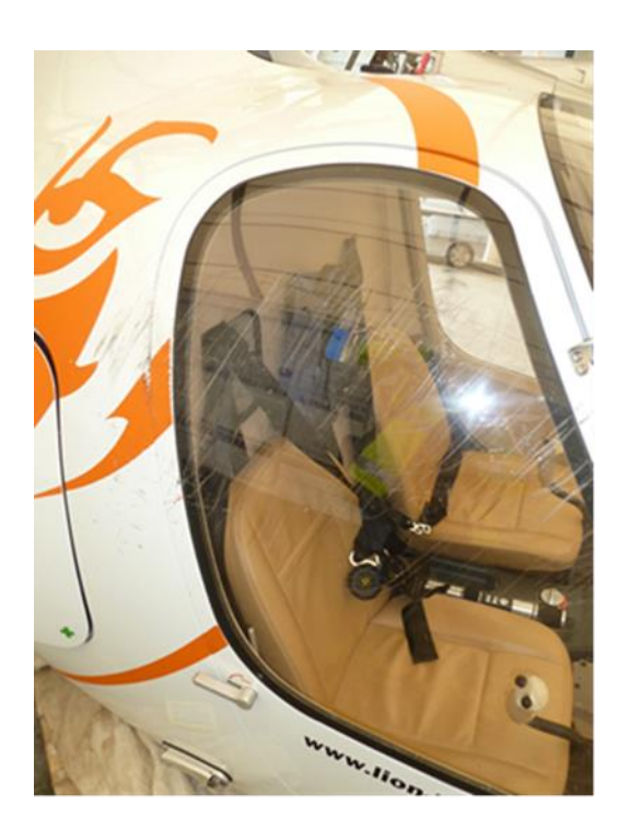
Picture 3. From inside, the pilot cabin did not show any signs of damage; the cabin was slightly damaged on its right side

During a detailed inspection of the crashed helicopter, in particular of the functionality of the pedal control and of the functionality and integrity of the fenestron transmission, it was found that such elements were and remained functional even after the accident, except for the transmission which was disrupted as a result of the violent stoppage of the fenestron during the accident as a consequence of the engine torque.