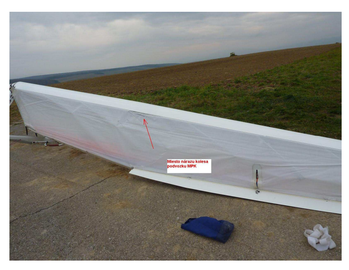
Fig. 1: Wing of Phantom PHG and point of impact of the landing gear wheel