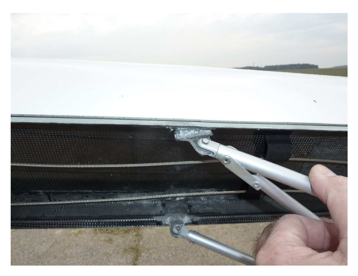
Fig. 3: Damaged upper attachment of Phantom PHG wing rib