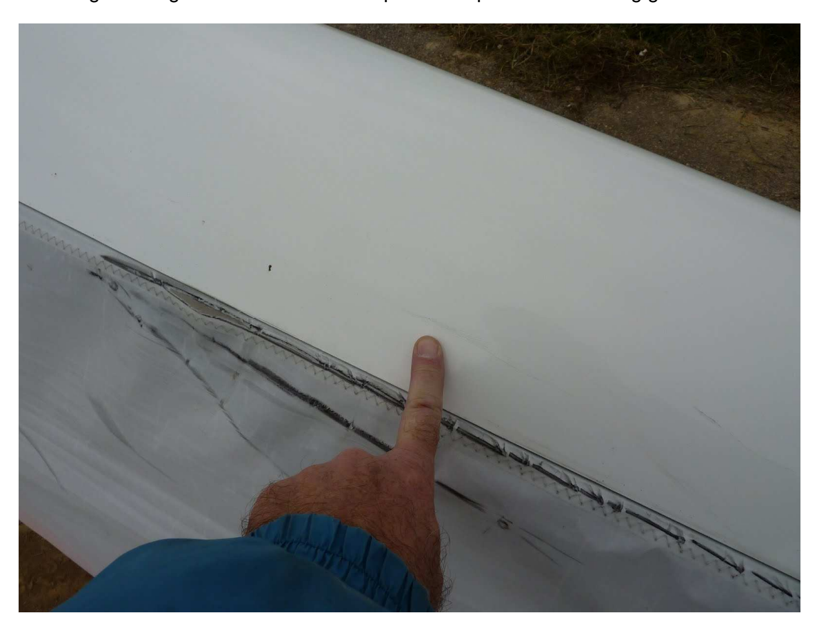
Fig.. 2: Damaged D-box and wing covering of Phantom PHG